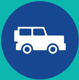
SUV & Cars