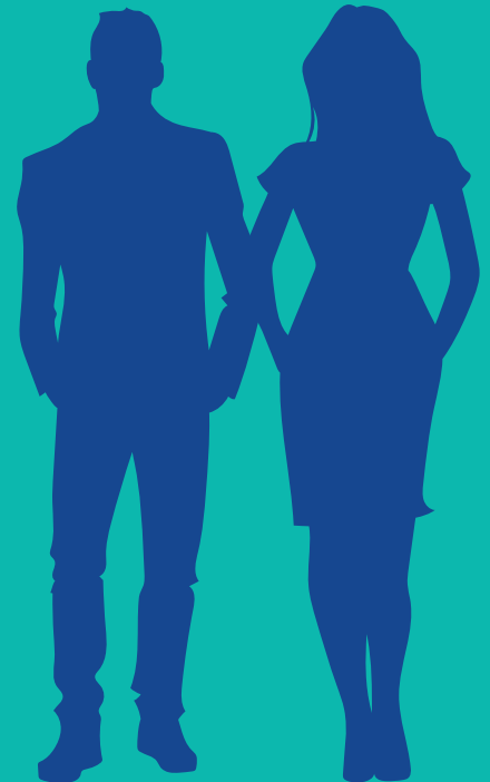
Even People Exhaling