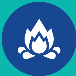
Wood Fire Pits